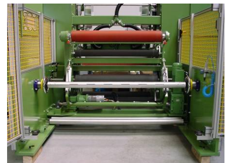
Unwinding stand for off-line operation

The sophisticated control system of the entire winding machine relieves the operator and ensures the high efficiency of the SOMATEC Short Roll Winders.