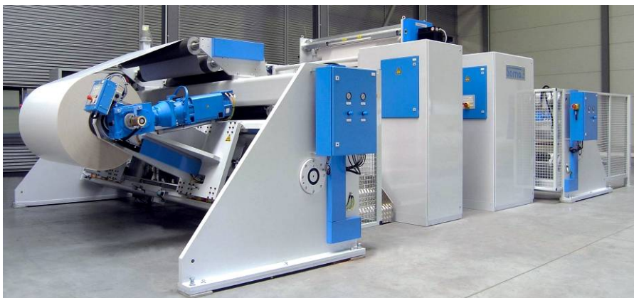
Re-reeler for composite material